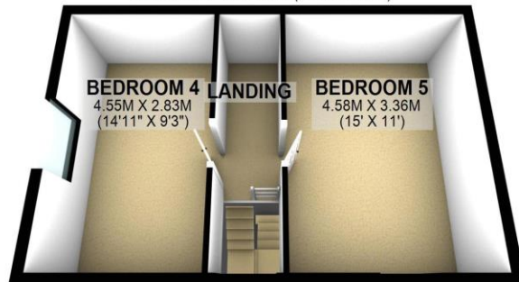
SECOND FLOOR APPROX. 34.5 SQ. METRES (371.4 SQ. FEET)